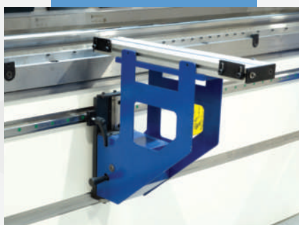
Adjustable Sliding Front Support Arms

Alpmac Model A Hydraulic press brakes, presenting low investment cost, high productivity and ideal price-performance solution.