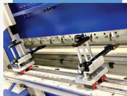
1 AXIS - X (R Manual)