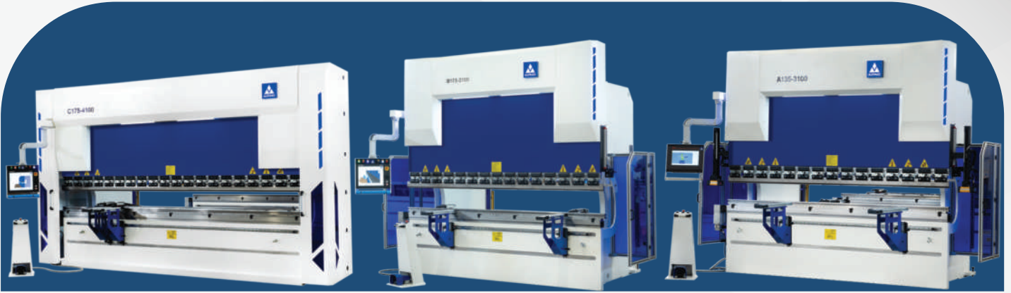
Model A- B- C Differences